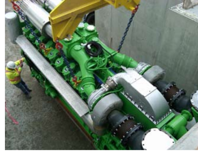
Installing GE Jenbacher Engine at UBC