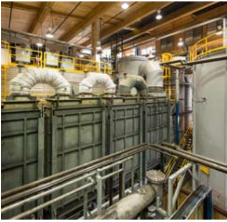
Syngas Thermal Cracking/Conditioning System