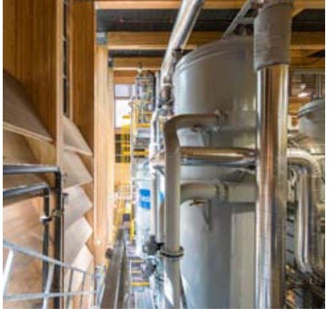
Walkway – Oxidizer to Gasifier