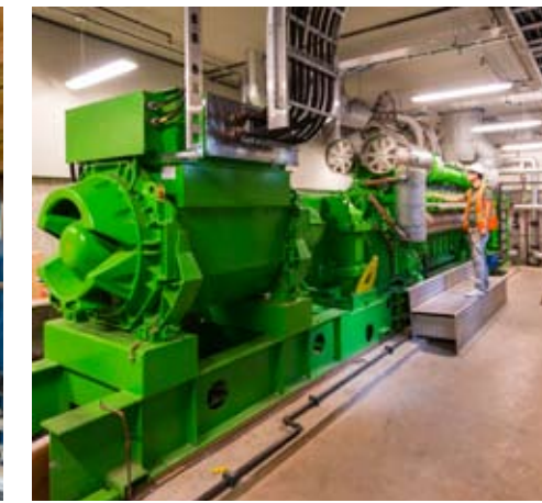
GE Jenbacher Engine

Photo Credits: Don Erhardt and Mits Naga