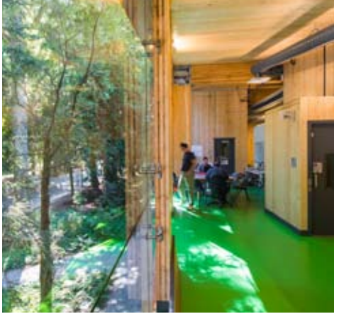
Entrance Work Area