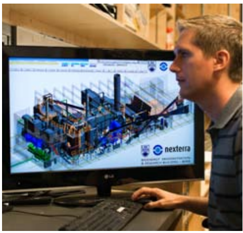
State-of-the-Art Controls System