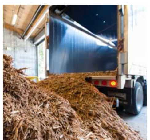
Truck Unloading Fuel