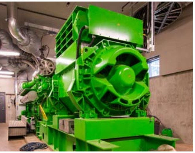
Engine at UBC CHP Plant