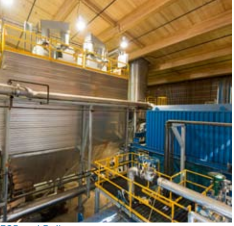
ESP and Boiler